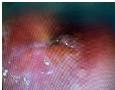
Fig. 1: Endoscopic view of Barrett's oesophagus

APC was performed (Fig. 1-3) at a power setting of 55 W, which is 10 W lower than the published literature [10]. Argon gas was supplied at 1.5-1.8 L/min. Each patient underwent single session of APC under total intravascular anesthesia (TIVA) with injection propofol (1mg/kg body weight) administered intravenously by an Anesthetist. Intravenous tiemonium ethyl sulfate injection (5 mg) was applied 15 minutes prior to the procedure to reduce oesophageal spasm in order to ensure precision APC and also to avoid any possible complication. Patients were monitored for minimum 1 hour or till complete recovery from TIVA and allowed to go home subsequently. They were advised to take liquid or semi-solid diet for the next 48 hours and were put on proton pump inhibitor for next 2 months.