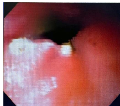
Fig. 3: Endoscopic view of post APC Barrett's oesophagus