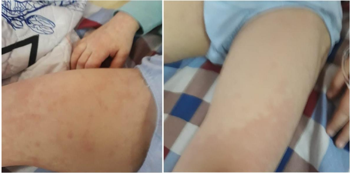
Figure-1: After eight days of treatment, the boy was still having generalized skin rash affecting the trunk and limbs

daily) for two days. Blood for culture was taken few days after the start of antibiotic therapy didn't reveal the infective organism. ASO titer was negative, but C-reactive protein was positive at the level of 48mg/L.